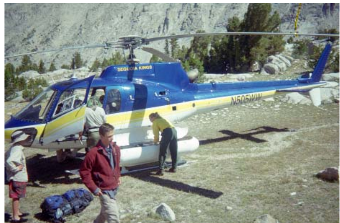
Park Rangers attending to Scout in the helicopter at Golden Bear Lake

There were three people onboard: the pilot, the Park supervisor and a technician. After loading our scout and his gear into the helicopter, the pilot did a quick weight calculation and determined that 4 people would be too much weight for the helicopter to take off from this location. He surveyed the area and pinpointed a grassy area on top of a bluff that would provide better aerodynamics for a takeoff with 4 people. The technician hiked over to this area and was picked up by the waiting helicopter.