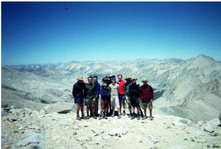
Troop 33 on top of Junction Pass (13,200').

On day seven of the ten day loop, we stood at the top of Junction Pass for this group picture. Little did we know that within the next 24 hours, we would be involved in a medical emergency.